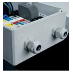
Incoming/Outgoing cables M20 cable glands