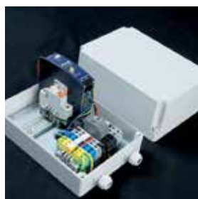
PS 120 120VA power supply