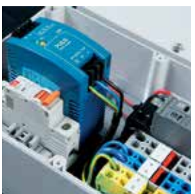
Connection Screwless terminals