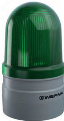
Base mounting with cable exit at side