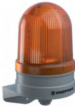
Bracket mounting with cable gland