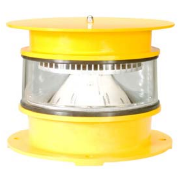
PATENT PENDING 2011/0121734 A1