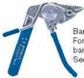
Bantam Tool C075 For application of coated band. See page 14 for details