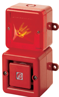
AL100SONTELFASH Combination telephone initiated alarmsounder and Xenon beacon.