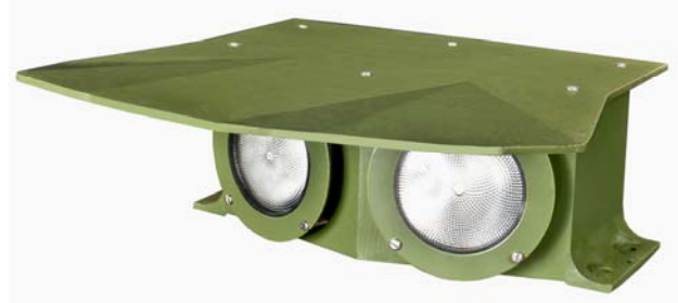
ETL Control Number 3030033

Note: For aircraft safety, we recommend that this type of light be installed outside the markings of the landing surface defined FATO perimeter.