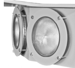
Detail of Clamp Ring, Clear Lens & Gaskets Subassembly

Bolt Pattern: Four (4) holes for 3/8-16 screws Arranged on 2.50 x 15.25-inches Cable Entry: One (1) 3/4-inch NPT threaded (Standard) hole for conduit or cable gland (by others)