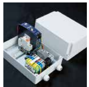
PS 120 120VA power supply