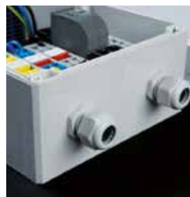
Incoming/Outgoing cables M20 cable glands