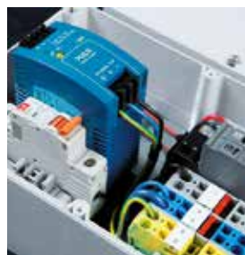
Connection Screwless terminals