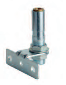
Flange with counter-plug for electrical connection (accessory)