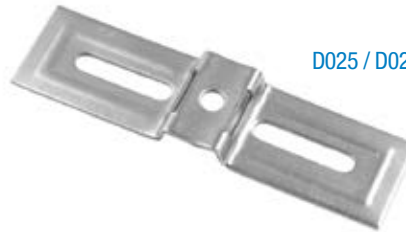
D025 / D026