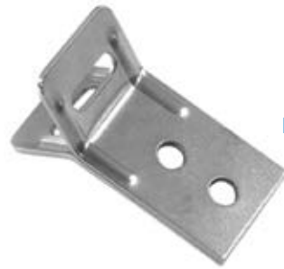
DE096 / DE097